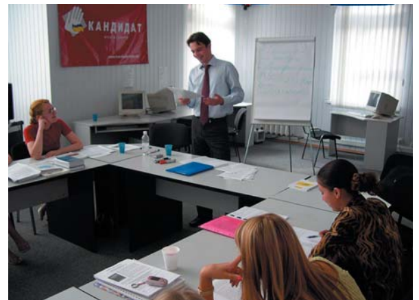
Ukrainian lawyers and law students participated in the Media Law Summer School in 2005.

• Election Law Amendments: In July 2005, the Ukrainian Parliament adopted a new election law that included several amendments on the media proposed by MLI. In particular, Parliament removed from a previous law the provision that a journalist could comment on a party's program only if it was paid for by another political party. MLI was first to target this provision as non-democratic and, on June 23rd, it issued a widely distributed statement to this effect. MLI also worked on provisions that have already become part of the election law — such as the candi-